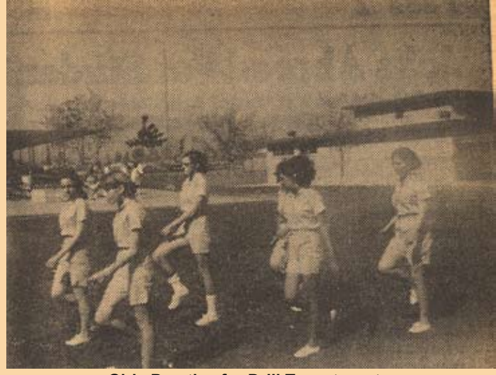
Girls Practice for Drill Team tryouts

Along with asking the boy, the girls are expected to present their escort with a lei, which can be bought or made of wood fiber, to add to the atmosphere. So start planning girls, you have only three weeks left. Tickets will go on sale soon.