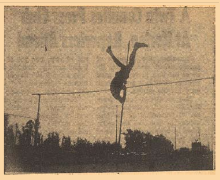
Bee Vaulter Clears Cross Bar Again.

North Rialto Shopping Center Mon.-Fri. 9:30 to 6:00 Closed Sunday